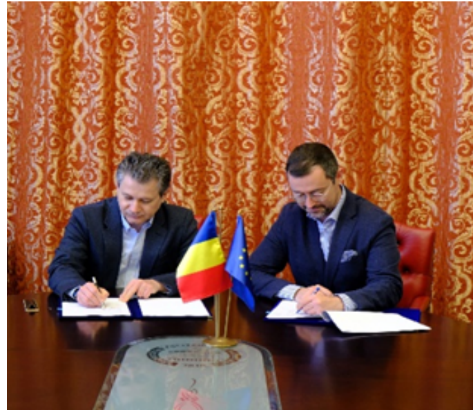
George Haber © 2022